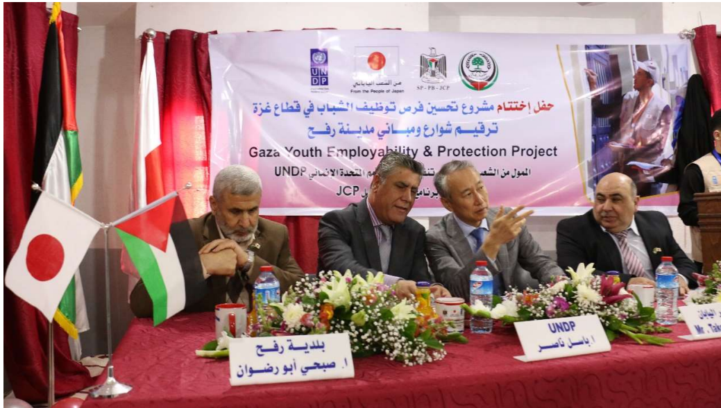
Closing Ceremony of the Youth Employability project with the attendance of the Ambassador of Japan, UNDP Head of Office in Gaza and Mayor of Rafah