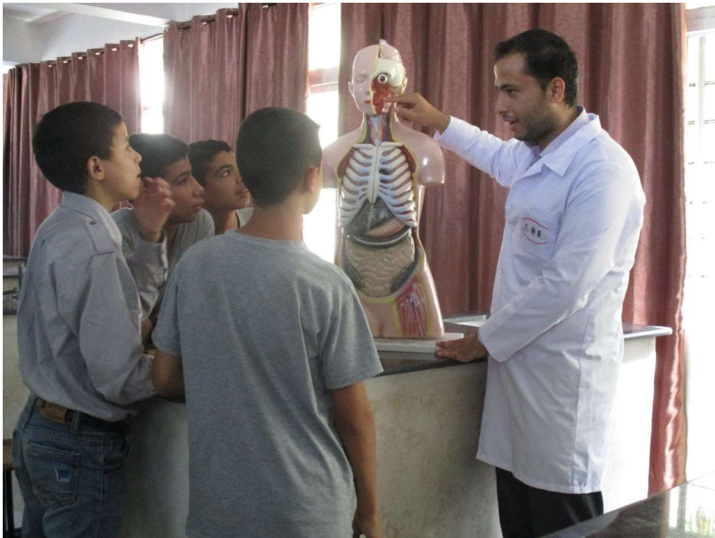
Biology teacher in class as part of the Youth Employability project in schools